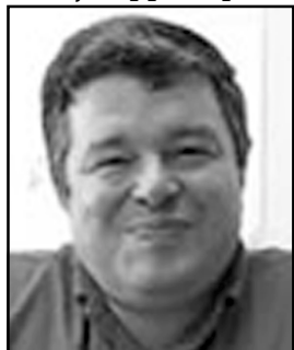
Tim Tyson, author of Blood Done Sign My Name