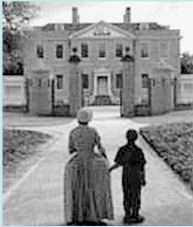
Historic Tryon Palace New Bern